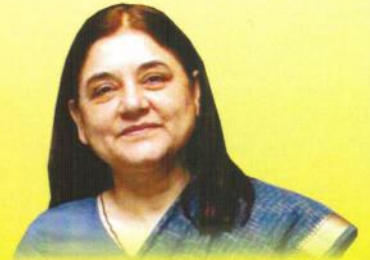
Smt. Maneka Sanjay Gandhi Minister for Women & Child Development