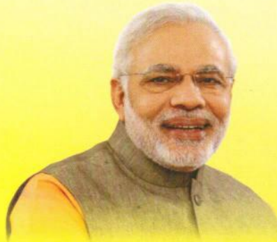
Sri Narendra Modi Prime Minister