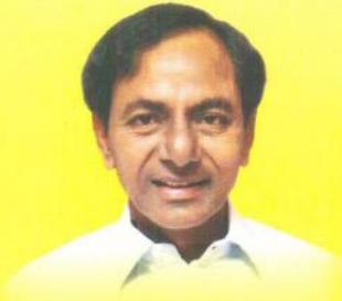
Sri K. Chandrashekar Rao Chief Minister of Telangana